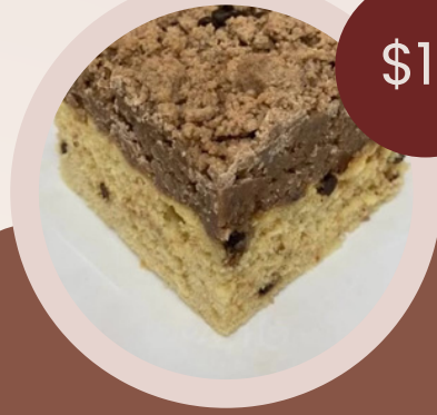
Vanilla Chocolate Chip Crumb Cake