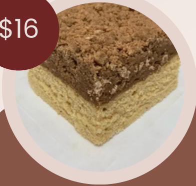
Classic Vanilla Crumb Cake